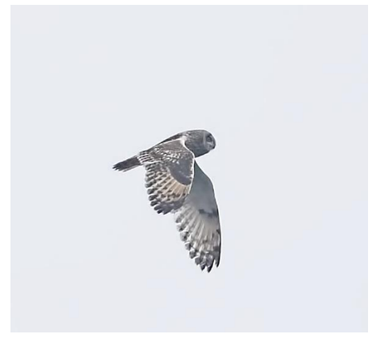
Short-eared owl taken by Stuart Carlton, 2019